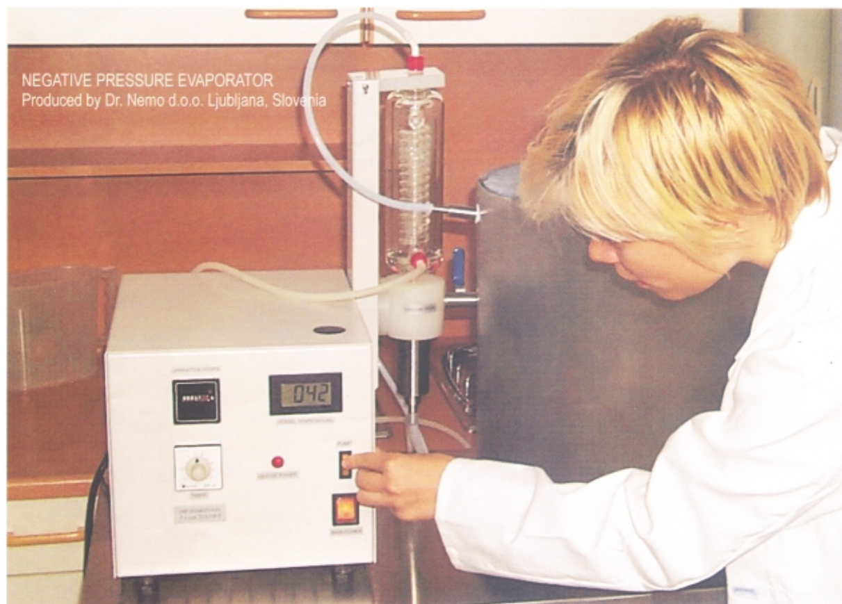
NEGATIVE PRESSURE EVAPORATOR Produced by Dr. Nemo d.o.o. Ljubljana, Slovenia