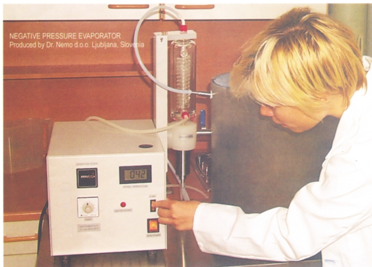
NEGATIVE PRESSURE EVAPORATOR Produced by Dr. Nemo d.o.o. Ljubljana, Slovenia