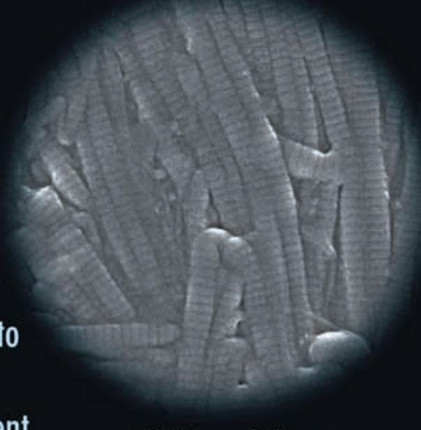
FEGSEM image of Collagen taken on the JSM-7500F

From Gentle Beam Imaging of Biomaterials to In Vitro High Resolution Reconstructions JEOL lead the way in Life Science Development