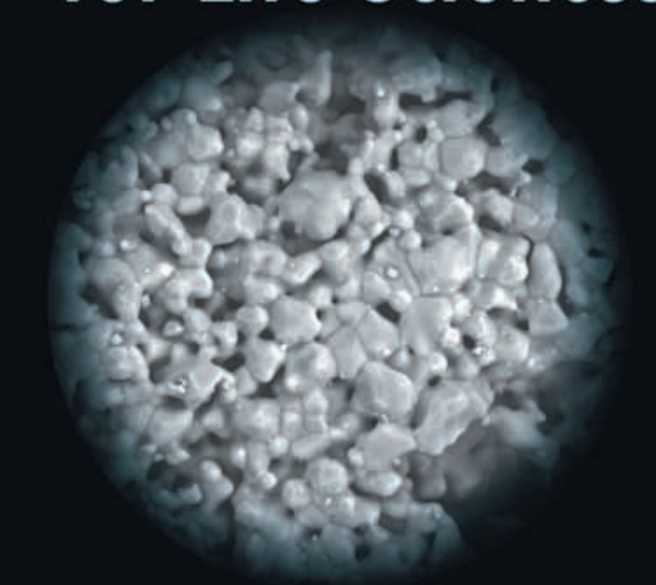
SEM image of HA Scaffold taken on the JSM-6610LV

Bring your samples to one of our European Application Centres and see for yourself